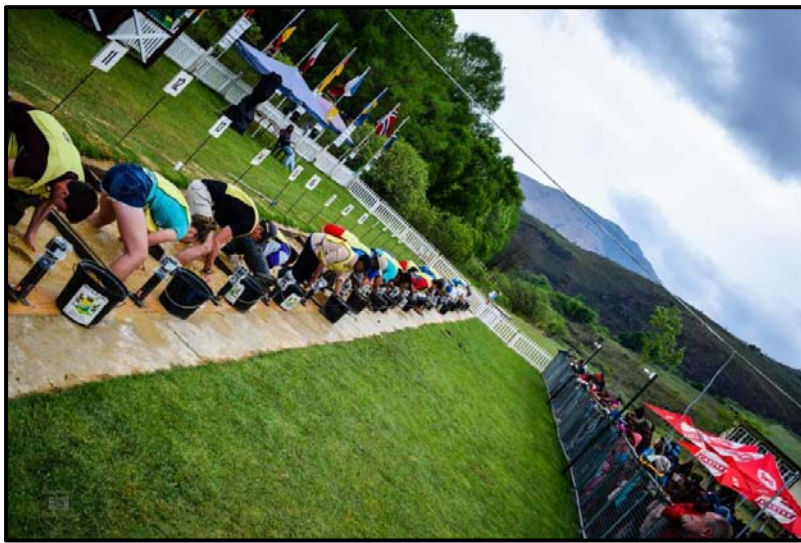
Figures 1 & 2) Competitors at a previous Championship

We look forward to the event, and working with the key stakeholders in the area, with whom we are currently working with as we progress towards re-commencement of commercial gold production at Pilgrim's Rest.