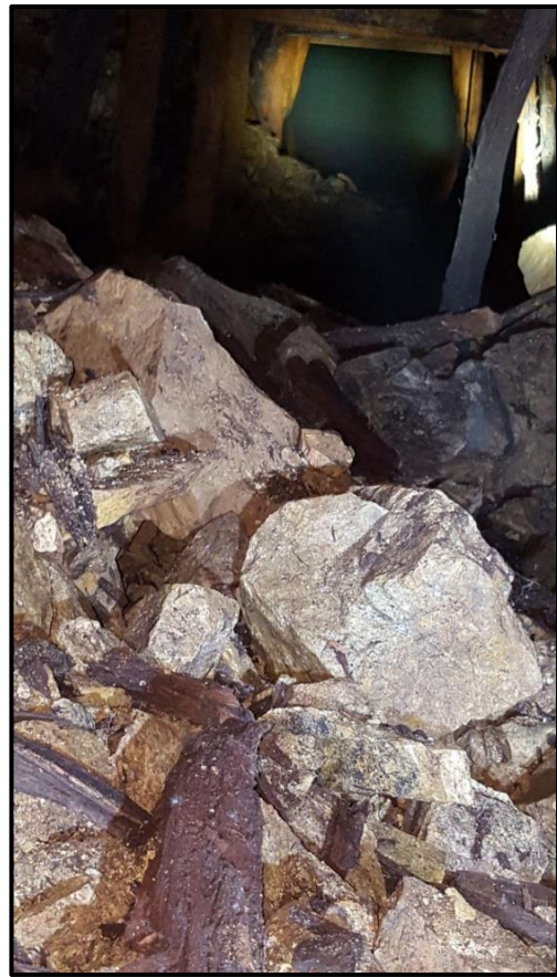
Figure 5) Dewatering underway at Rietfontein Mine