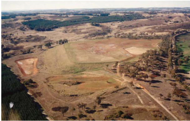
Aerial view of Lucky Draw tailings dam Oblique Aerial Photographs

Developed Resources conducted further metallurgical test work using wave table technology. Encouraged by their results, Developed Resources agreed to move forward with a trial mining operation to be conducted at Lucky Draw in the first quarter of 2012.